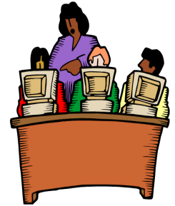
Computer Lab at Earl Williams Currently not Available for use due to COVID-19